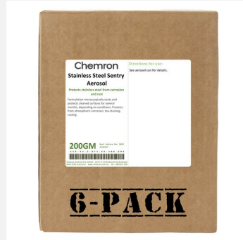
Stainless Steel Sentry Aerosol