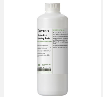
Stainless Steel Rejuvenating Paste