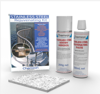
Stainless Steel Rejuvenating DIY Kit