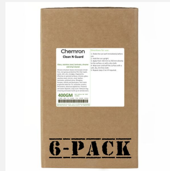
Clean N Guard