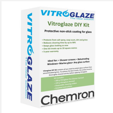
Vitroglaze DIY Kit