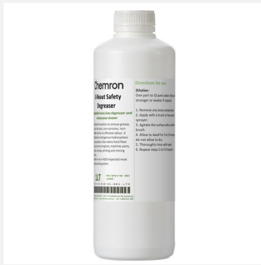
U-Beaut Safety Degreaser