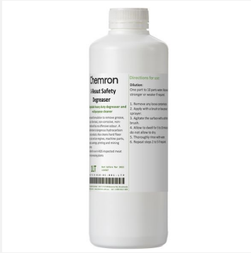
U-Beaut Safety Degreaser