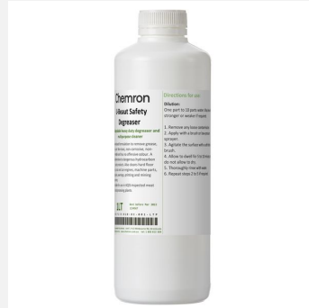
U-Beaut Safety Degreaser