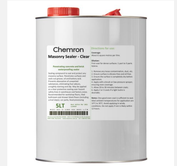
Masonry Sealer - Clear