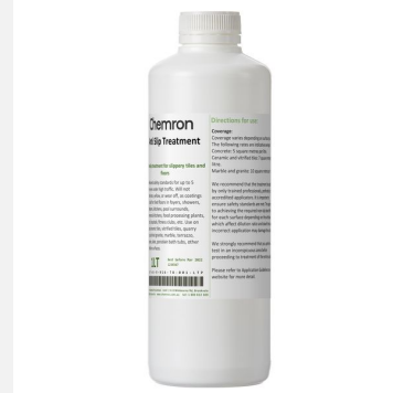
Anti Slip Treatment