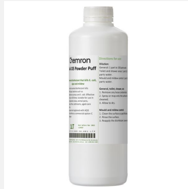
Dual 105 Powder Puff