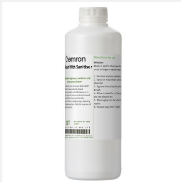
U-Beaut With Sanitiser